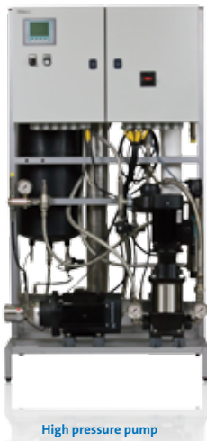
High pressure pump