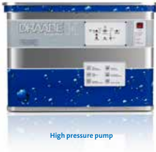
High pressure pump