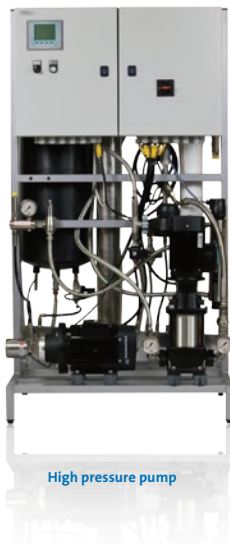
High pressure pump