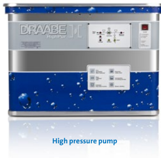
High pressure pump